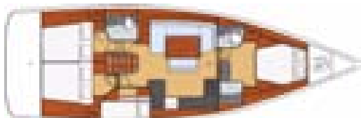
4 cabins - 2 head compartments