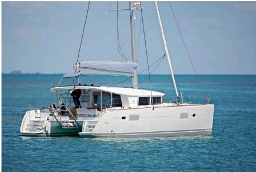
Lagoon 400 - La Rochelle 16/06/2009 - Membre obligatoire / Mandatory crew!