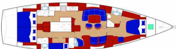
Version forward master cabin