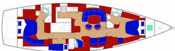
Version 2 master cabin