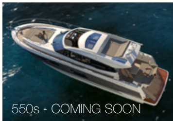
550s - COMING SOON