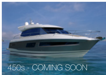
450s - COMING SOON