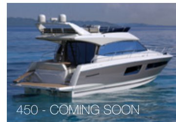
450 - COMING SOON